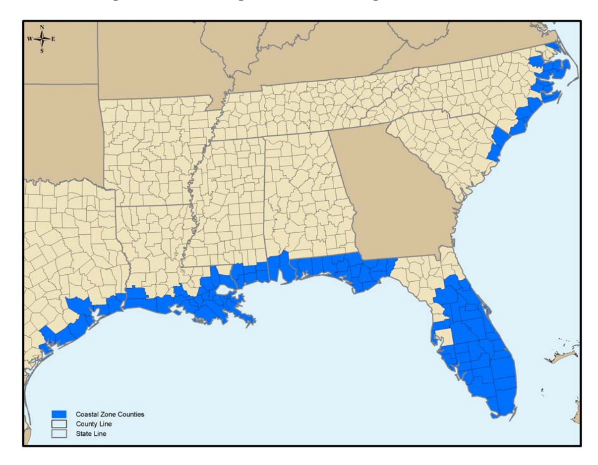
OFigure 3.3-1. TAP Eligible Counties in Designated Coastal Zone